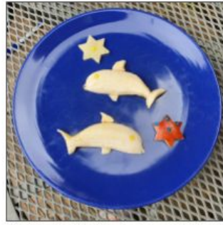
By Tudor M - Shakespeare Primary