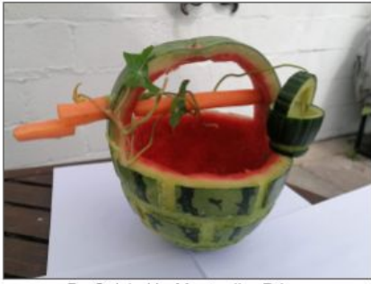
By Calvin H - Montpelier Primary