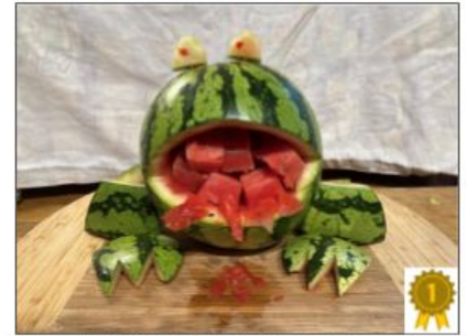
By Katie W - Hyde Park Primary