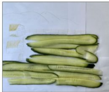
By Lukasz K - St Peter's Primary