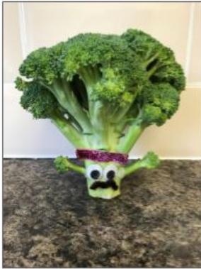
By Evie L - Glen Park Primary