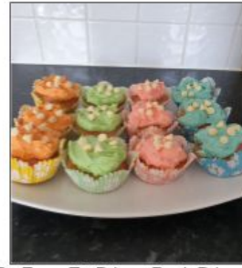
By Erryn T - Prince Rock Primary