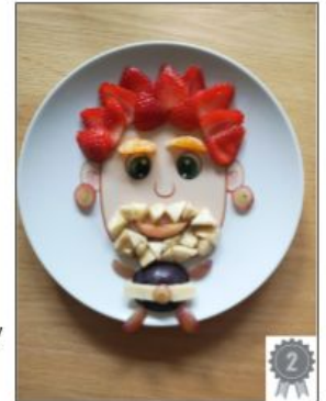
By Kari A - Chaddlewood Primary