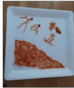
By Megan M - Plympton St Maurice