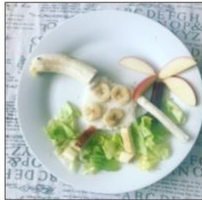
By Jake L - Plympton St Maurice