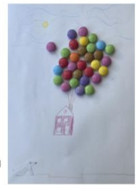
By Lukasz K - St Peter's Primary